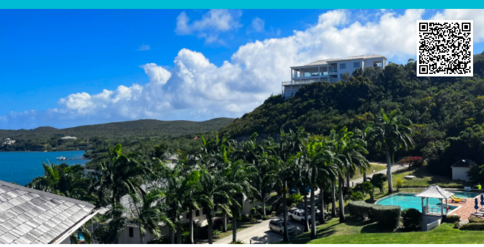
😐 2 🖺 2 🚨 8000 sq. ft / 0.15 ac. 🗥 2800 sq. ft

Nestled within the stunning Nonsuch Bay Resort, encompassing nearly 40 acres of pristine land in a picturesque cove, this luxurious penthouse apartment offers a truly exclusive and private living experience.